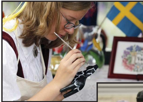
Continuing the Swedish tradition of decorating dala at 2014 IFest.