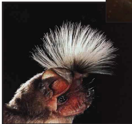
Left: Chapin's bat

creatures. Some have been the stuff of horror stories – think of the blood sucking vampire bats of Central and South