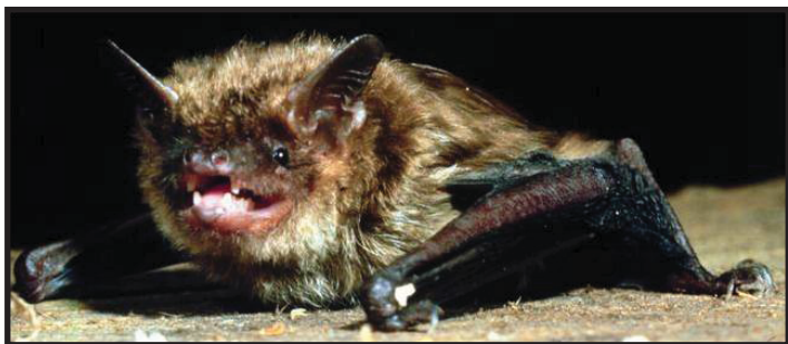
Year-round Illinois resident, the Big Brown Bat

There are over 1,250 species of bats worldwide. They come in all shapes and sizes and are unique