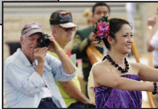
Hawaiian dancer at 2014 IFest

The free festival will feature music and entertainment, ethnic cuisine, children's activities, a "world market" and cultural arts and crafts. The festival will be sectioned into regions, so that it will feel that like festival goers are walk-