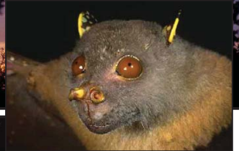
Above: Tubed nosed fruit bat